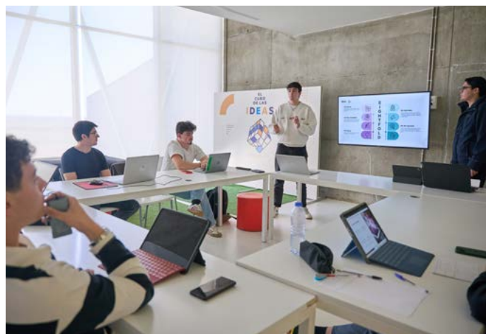
USJ + Agora