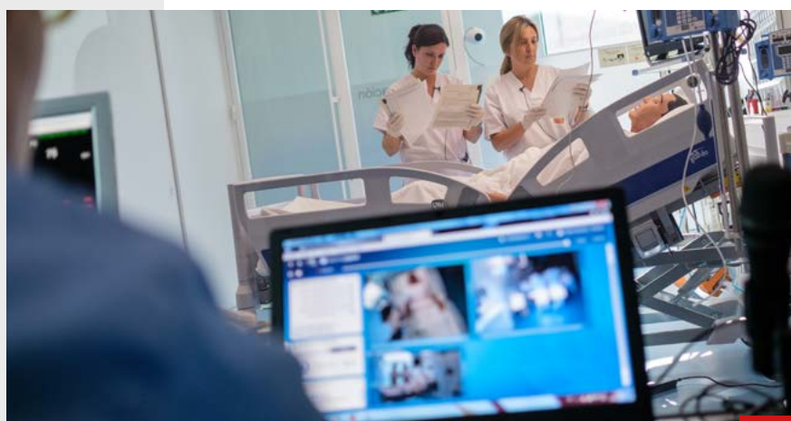
Clinical Simulation Space