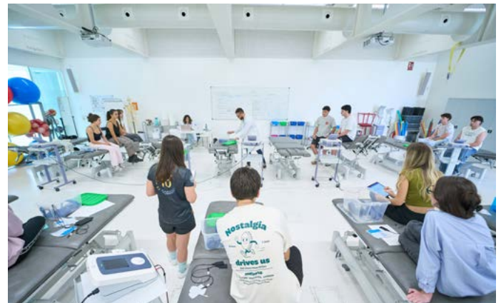
Simulated Physiotherapy patient case

OSCE will be presented as an assessment system currently being implemented transversally across the Faculty of Health Sciences, aimed at objectively and systematically evaluating students' clinical competencies through simulation stations. Specifically, the session will outline the implementation experience in the Physiotherapy Degree, highlighting its practical application in assessing professional skills, clinical reasoning, and communication within simulated contexts.