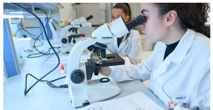
Biomedical Laboratory · Histology Facilities

The use of platforms such as Hack The Box will be presented to reproduce real attacks through CTF challenges and Pro Labs that simulate complete enterprise networks. The session will include practical examples of pentesting, forensic analysis, and incident response, illustrating how these simulations allow participants to work through the full cycle of an attack and develop technical competencies in a safe and highly realistic controlled environment.