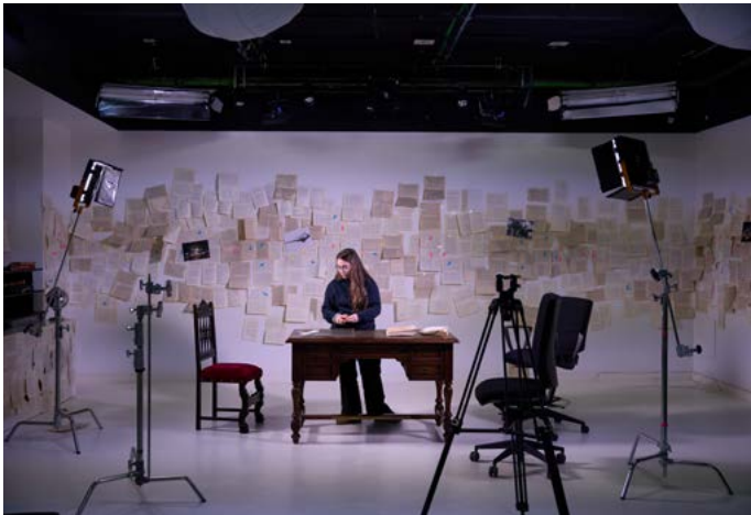
Television Studio Simulator