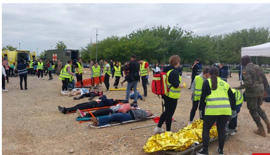
Terrorist Attack Simulation · 2025