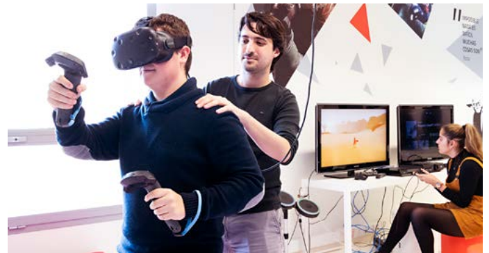
Virtual Reality Workshop · Maker Spaces

Virtual Reality will be introduced as a teaching tool for generating interactive scenarios that allow students to explore, visualize, and manipulate complex content. Through VR headset demonstrations and interdisciplinary collaborative projects, its potential to enhance experiential learning will be showcased. The session will also analyze how this technology fosters active learning, spatial understanding, and experimentation within simulated environments.