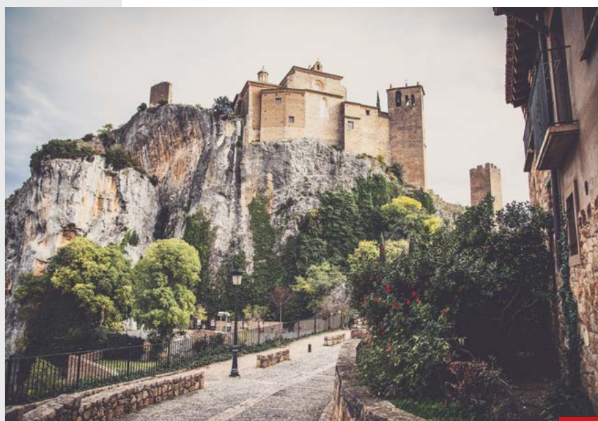
Alquezar, medieval town in Huesca, Spain