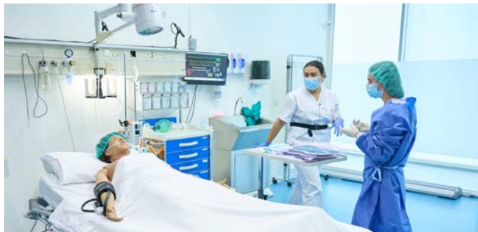
Critical care patient simulation

Clinical simulation will be presented as an active methodology applicable to different educational contexts, showing how scenarios are designed and adapted to the students' developmental and training levels. In addition, the use of structured debriefing will be explained as a key strategy to guide the experience, encourage participation, and optimize learning.