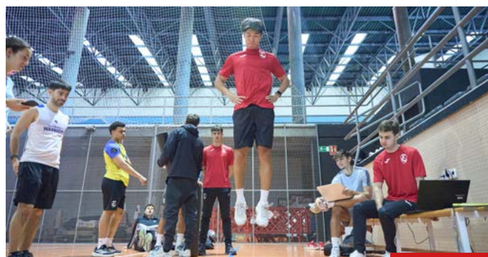
Simulation with Photocells and Jump Platforms

Clinical simulation will be presented as an active methodology applicable to different educational contexts, showing how scenarios are designed and adapted to the students' developmental and training levels. In addition, the use of structured debriefing will be explained as a key strategy to guide the experience, encourage participation, and optimize learning.