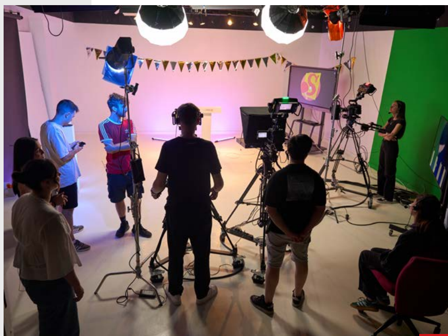
Television Studio Simulator