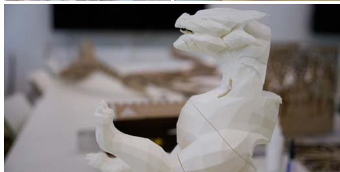
Exhibition model printed in the 3D printing workshop