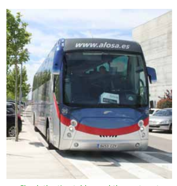
Check the timetables and the routes at www.usj.es/transporte

Walk, cycle or use public transport whenever you can. THE UNIVERSITY OFFERS YOU A SHARED TRANSPORT SERVICE.